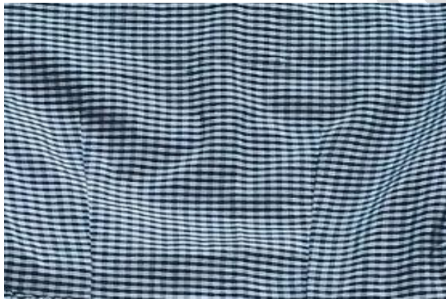
GREEN CHECK (Small Eye)